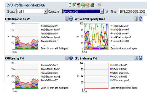
Track the performance and capacity of servers and applications on physical and virtual systems from a single user interface

Begin your performance analysis with server-level views of performance or add “workloads” consisting of the users, applications, and system resources for a more granular view of performance from a business service perspective. Performance bottlenecks can be rapidly identified and corrected, which streamlines business processes and improves customer satisfaction. Automated data filtering uses a management-by-exception process that enables system managers to quickly focus on the most business-critical information, saving time and improving productivity.